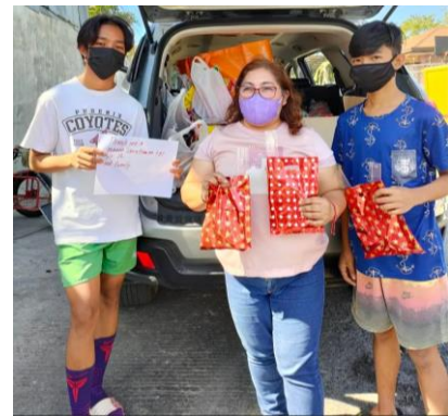
Distribution of pack lunch, slippers, face towels and school essentials to the 50 street children donated by the Spouses' Circle. Jan. 11, 2022