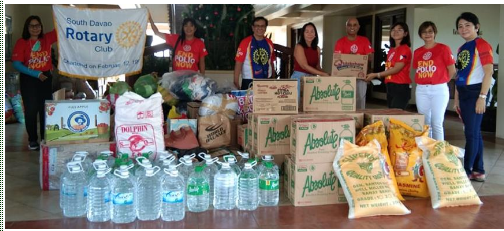
Hand-over of cash (P21,000) and miscellaneous relief goods from the Woodridge Park Homeowner's Association to the Rotary Club of South Davao for the typhoon Odette victims in Dinagat and Siargao Islands. Jan. 5, 2022